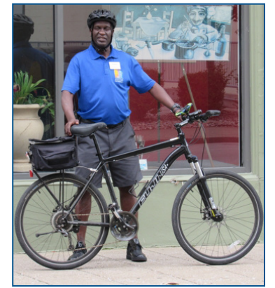
A publication of Louisville Downtown Partnership

Questions? Ask an Ambassador About Downtown